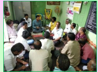
Cloth bags being handed over to the Mayor of Medak district, Telangana State on 15 th August'18 to replace plastic