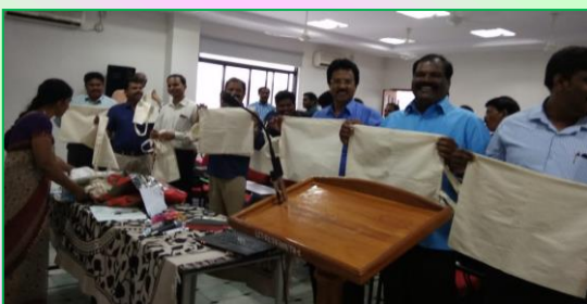
Promotion of cloth bags to replace