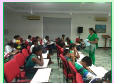
Environmental stewardship - Care for Environment Sessions