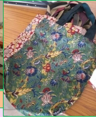
MAKING OF KHADI BAGS