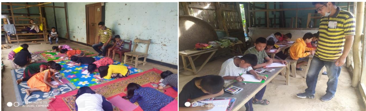
CM Collection Photo

The collection of the CMs was conducted under the supervision of Sponsorship Coordinator