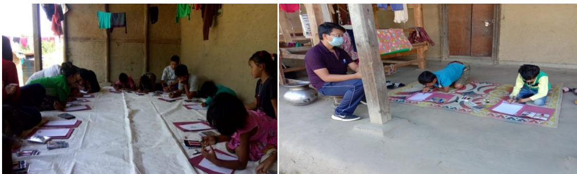
CMs collection photo of Waroiching and Heinoubok

The collection of the CMs was conducted under the supervision of Sponsorship Coordinator,