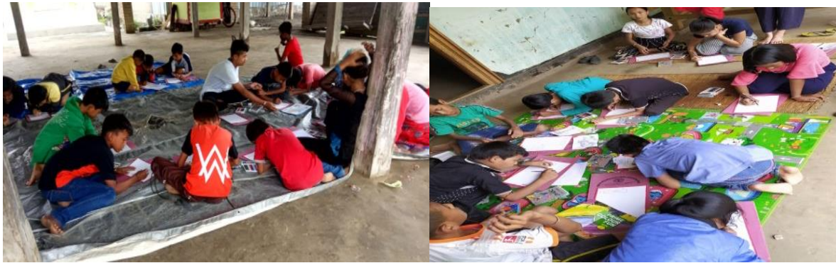
The CMs collection photo of Ishok&Naorem village