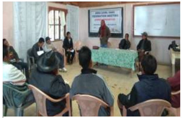
Phungyar Area level SMDC meeting at Chungka village