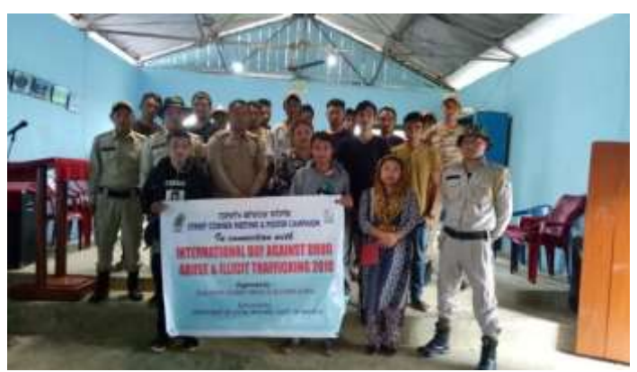
INTERNATIONAL DAY AGAINST DRUG ABUSE & ILLICIT TRAFFICKING WITH POLICE OF KASOM 2019