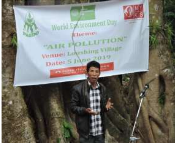
World Environment Day, 5th June, 2019 celebrated at Loushing Village

The Global Action Month (GAM) 2019 for Ukhrul was celebrated in 5 partner Primary School. A total of 141 children (66 boys and 75 girls) participated in the program. GAM was celebrated under the Theme of 'Children are the present, let's guarantee their future. End violence and exploitation! Two activities were taken up, 1) Village level awareness campaign was organised for cleaning of the village Government school campus, in and around the compound in all the partner villages. 2) The children also brought locally available trees and flowers and planted in their school compound.