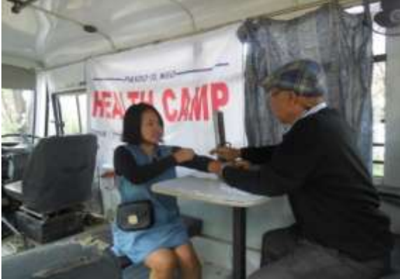
COMMUNITY HEALTH CAMP ON 12/11/2019 PASDO-TI, UKHRUL