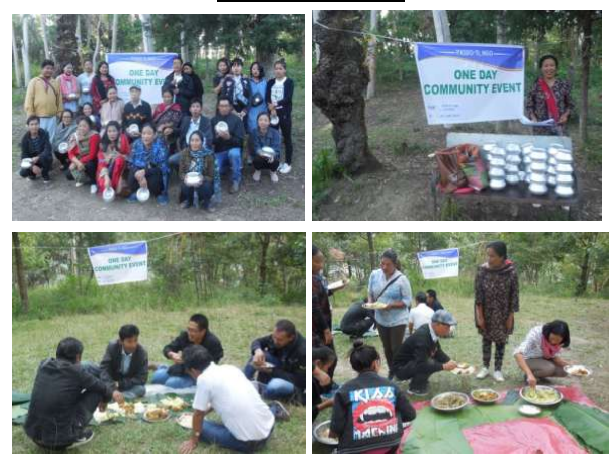
COMMUNITY EVENTS 8<sup>th</sup> Nov.2019 Venue: ORCHID PARK, UKHRUL