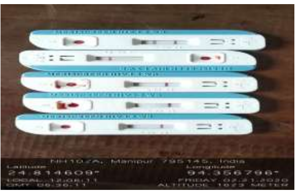
COMMUNITY BASED SCREENING CAMP AT PHUNGYAR ON 21/02/2020