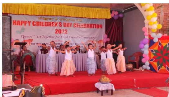
Children Day Celebration at Agency