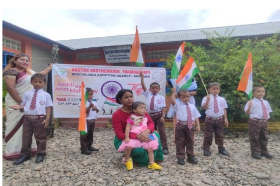
Azadi ka Amrit Mohasav celebration