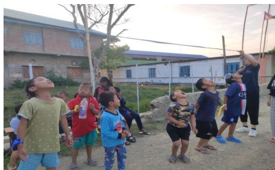
Children Participating at Sport