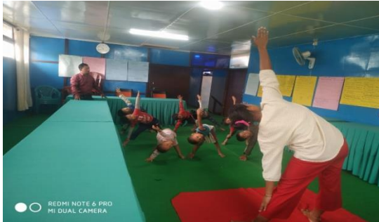
Inmates practicing yoga

having many doubts about it too but with the help of the agency they had registered successfully through proper counseling and guidance by the staffs of the agency.