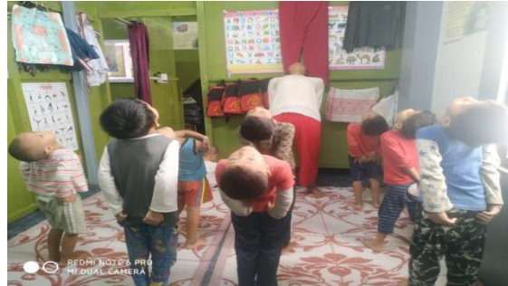
Inmates practicing yoga