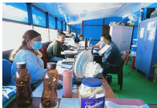
Inspection by DCPO