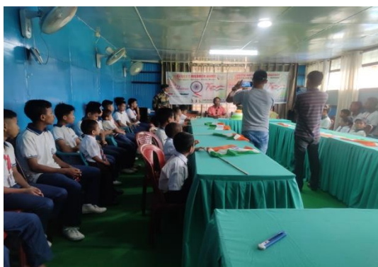
Children celebrating Independence Day