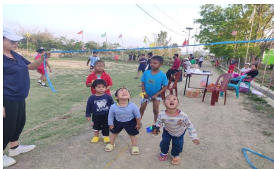
Children performing at children day