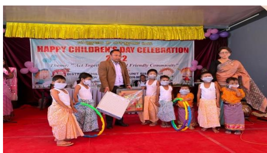
Children Day Celebration at Agency