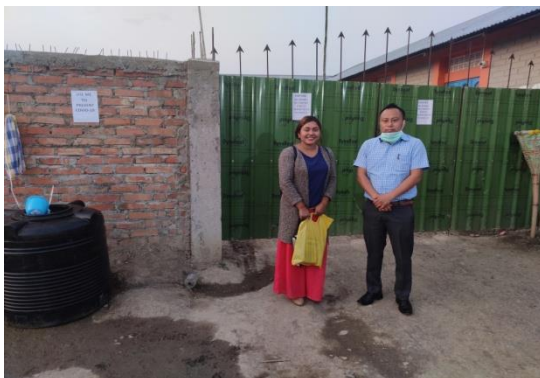
Inspections at Specialized Adoption Agency