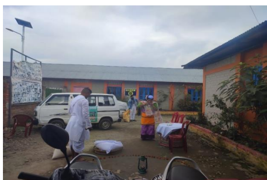
Lai kabok yenba at SAA BPR