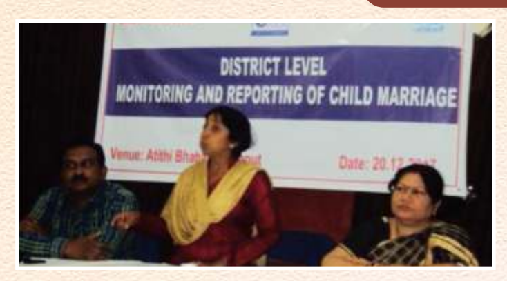
District level workshop on Child Marriage