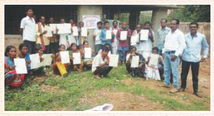
Village people got their rights under forest Rights Act (FRA)