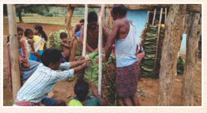
Storage of sialy leaf with simple traditional technique