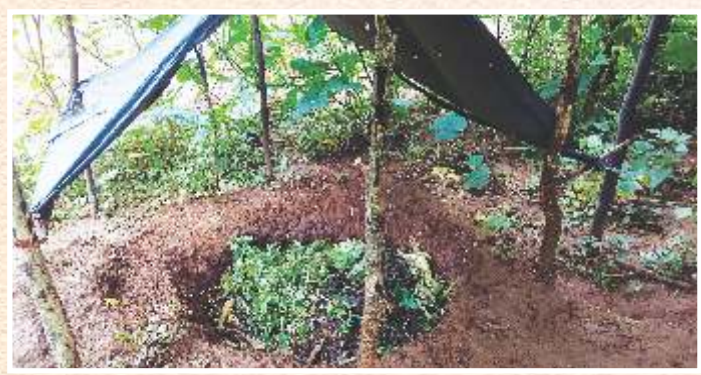
Compost pit under livelihood activities