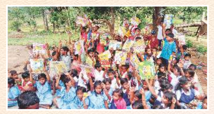
Education support to sponsor & non sponsor children