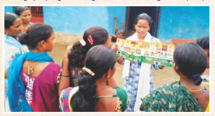
Field level orientation on food diversification to youths and adoloscents