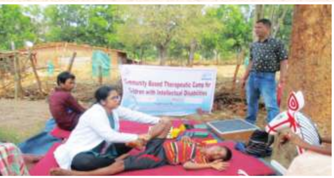
Community base Therapeutic Camp for the children with intellectual disabilities