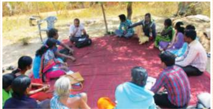
Carers group meeting under voice of the disabled their carers