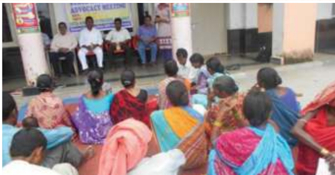
Stakeholder meeting under target intervention-HIV/AIDS project