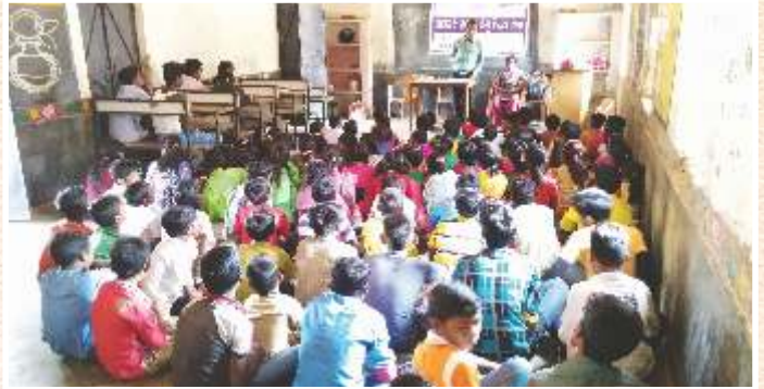
Panchayat level Child Assembly