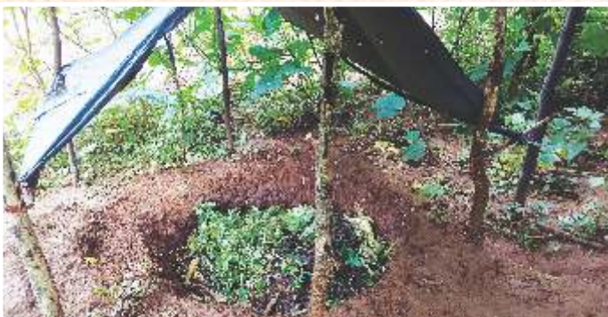
Compost pit under livelihood activities