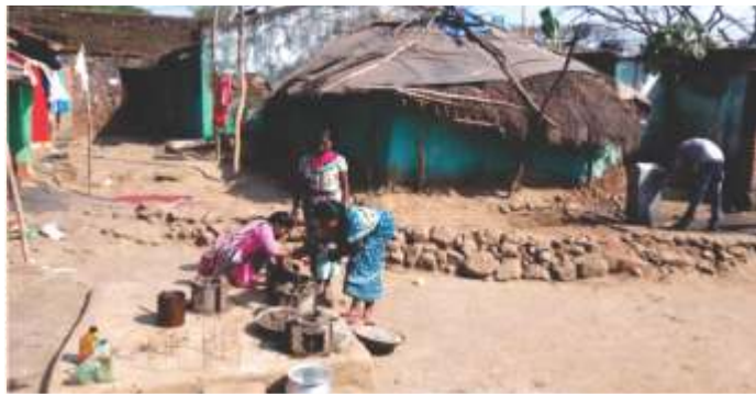
Manufacturing of clean cook stove by women federation under climate change & clean energy project