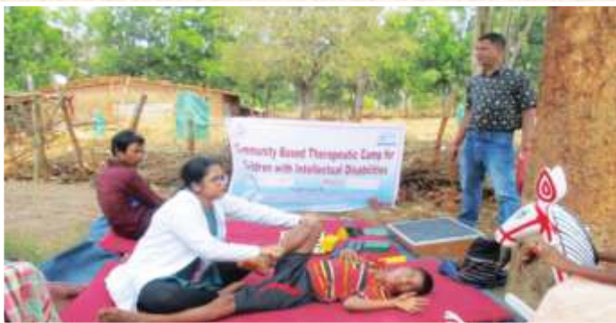
Community base Therapeutic Camp for the children with intellectual disabilities