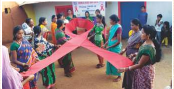
Observation of World AIDS day at community level under target intervention-HIV/AIDS project