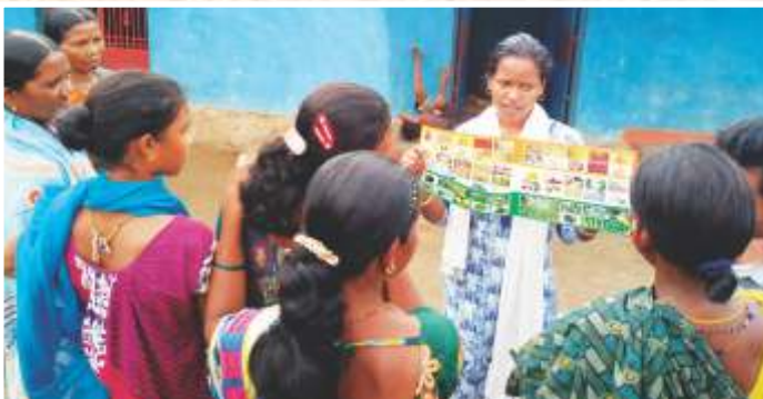
Field level orientation on food diversification to youths and adolescents