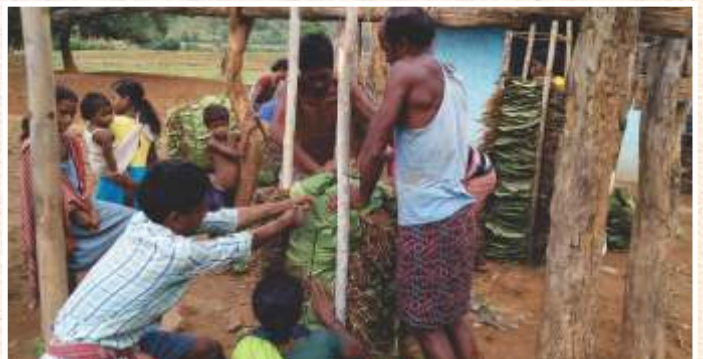
Storage of sialy leaf with simple traditional technique