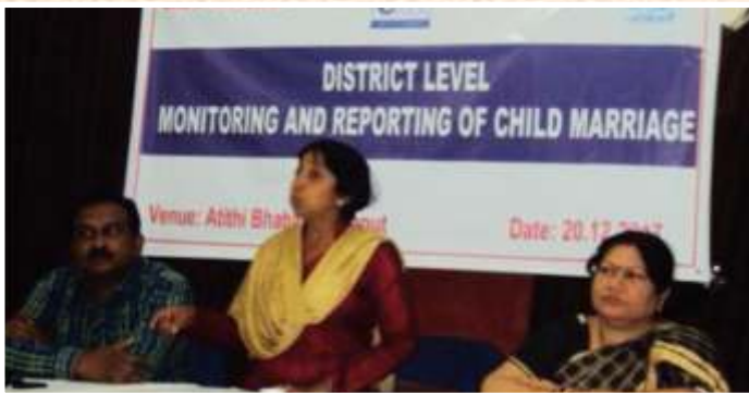
District level workshop on Child Marriage