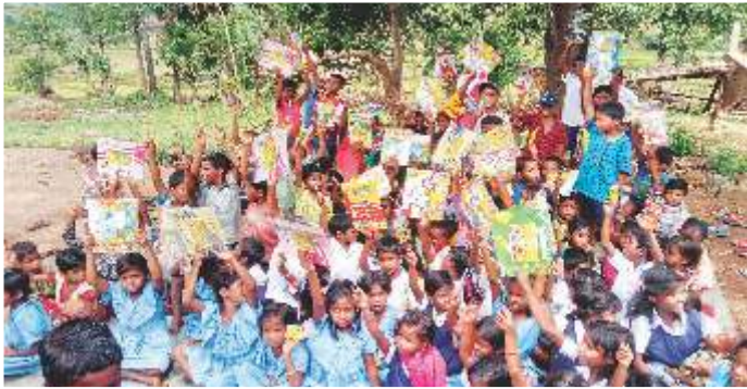
Education support to sponsor & non sponsor children