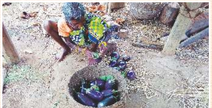
Collection of vegetables through mix cropping under livelihood activities