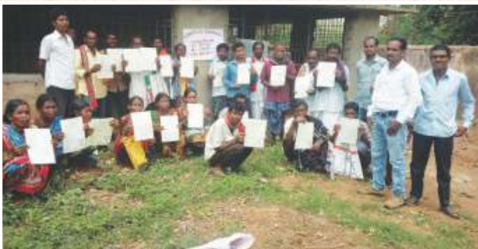
Village people got their rights under forest Rights Act (FRA)