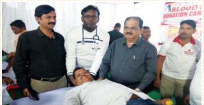
Blood donation camp on the occasion of International day for person with disabilities with presence of CDMO, DSSO & In charge of Blood bank officer, Koraput