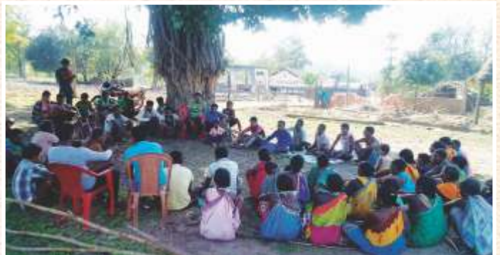
Panchayat level Meeting on Adivasi identity and culture