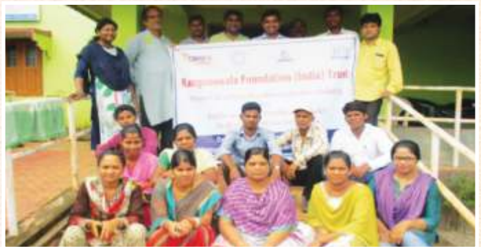
Project launching & induction workshop of voice of the disabled and their carers